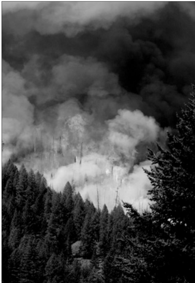
Flames consume a stand of Douglas fir west of Ketchum Saturday.